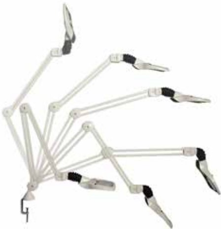
Self-balancing, friction-free arm.

The flexibility of the self-balancing arm and friction-free joint between the lamp head and arm makes exact positioning easy.