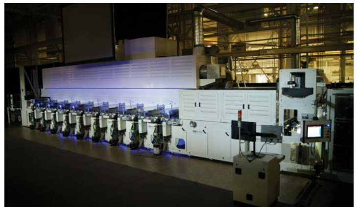
Figure 1: Phoenix Contact communications make it possible for a local operator to control this Aquaflex web printer from a handheld device and for engineers at PCMC to access the automation system remotely.

PCMC wanted a way to provide better remote maintenance and have the ability to troubleshoot customers' machines in a less expensive, more reliable, and more secure way.