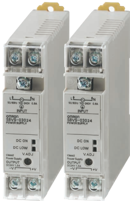
Super slim 15 & 30 W models