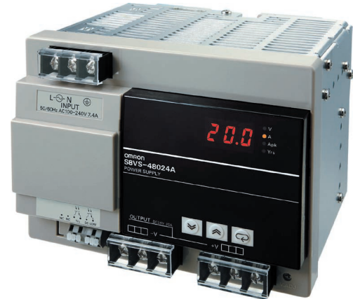
NEW 480 W models provide 20 Amps in a compact package