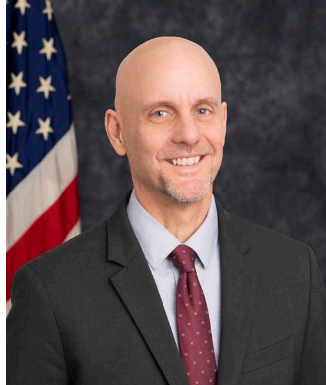
Dr. Stephen Hahn Commissioner of Food and Drugs