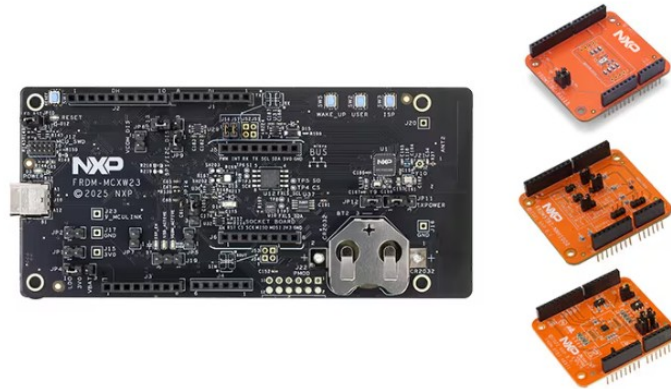
FRDM-MCXW23 board with sensor shield boards as an ecosystem.

The MCX W23 FRDM platform features a combination of low-power operation and easy sensor integration, giving developers the freedom to innovate. Using the FRDM-MCXW23 board , developers can explore new sensor use cases. Through stackable, modular expansion options, this FRDM board can be expanded with temperature, motion, pressure and magnetic switch sensors, for low-voltage operation and minimal external components. This accelerates the development of compact, wireless devices with staying power—less servicing or downtime. New demos showcasing sustainable sensing in action in the Application Code Hub (ACH) are being released for the FRDM-MCXW23 board and sensor shield add-ons. These ready-to-run demos showcase sustainable sensing in action and are available here .